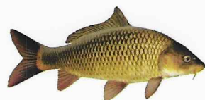
Made from whole European Carp